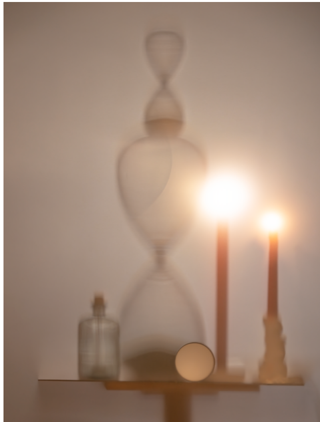
Inkjet print on Hahnemühle, mounted on Aludibond — 209 x 150,5 cm